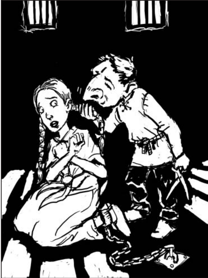
Minions want love