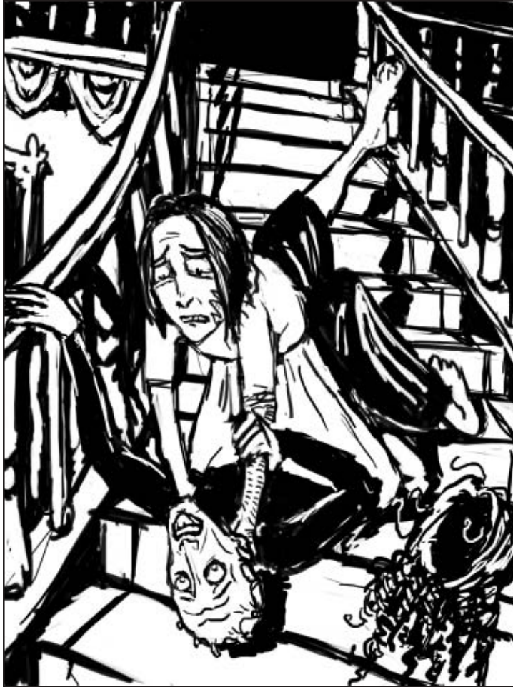
A minion will cause the demise of the Master