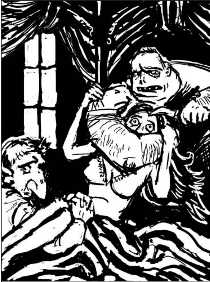
Minions do horrific things