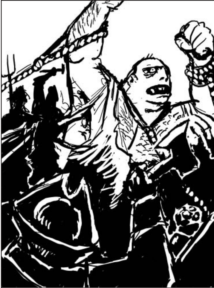
Volya is torn apart by a mob