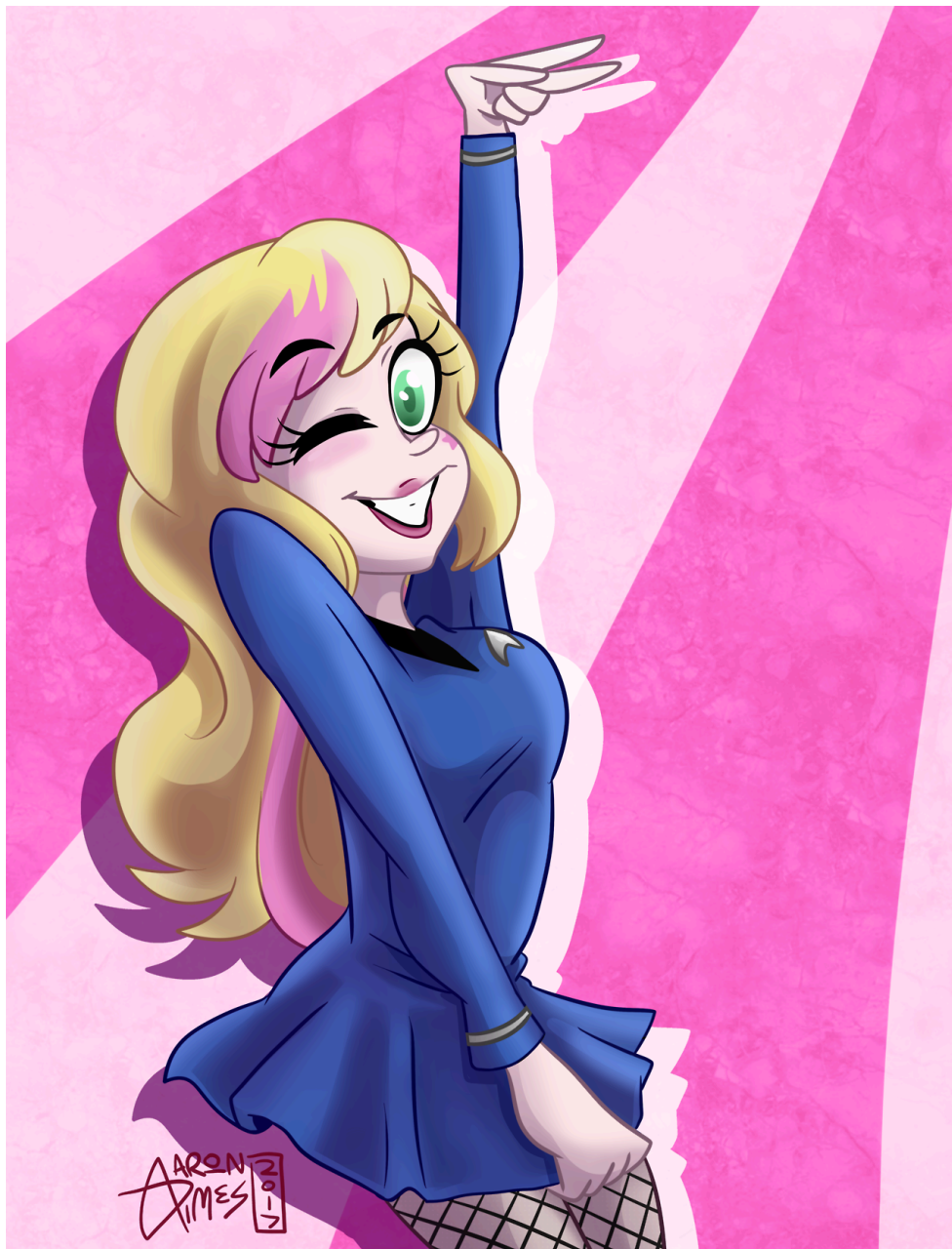
Ensign Sue - An Exalted Chain

This is much better, isn't it? It's all about me, after all.