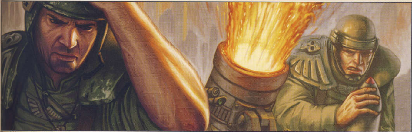
IMPERIAL ARMY • DAN SCOTT