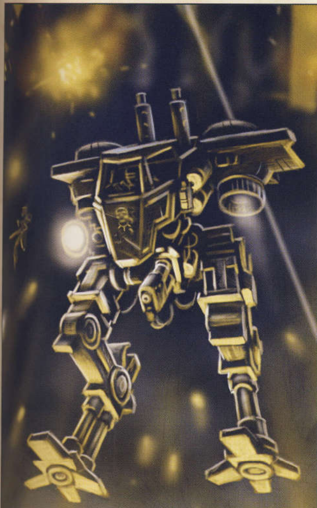
HORGAN'S SCRAPPERS • FELLESIAN 5TH AIRBORNE AUXILIARY • DES HANLEY