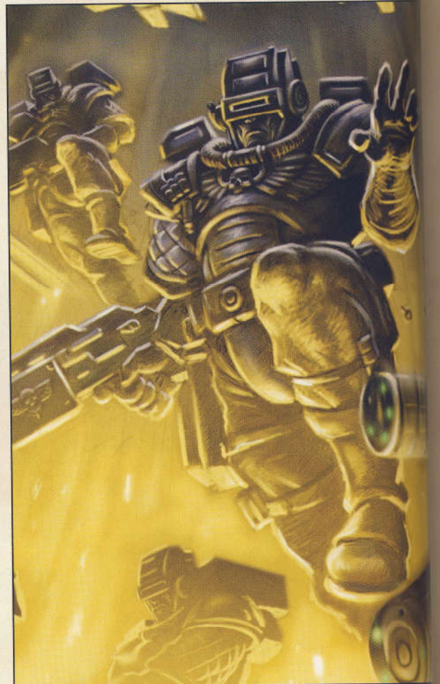
GOLDSTONE'S HUNTERS • FELLESIAN 23RD AIRBORNE • DES HANLEY