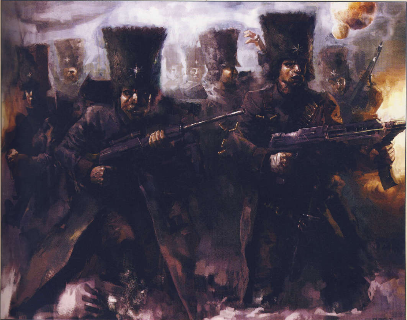
URSLOV 12TH INFANTRY • COS KONIOTIS