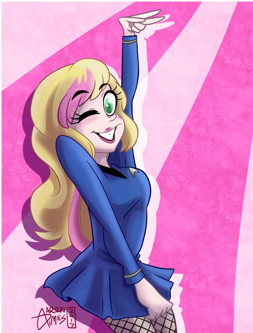
Ensign Sue - An Exalted Chain

This is much better, isn't it? It's all about me, after all.