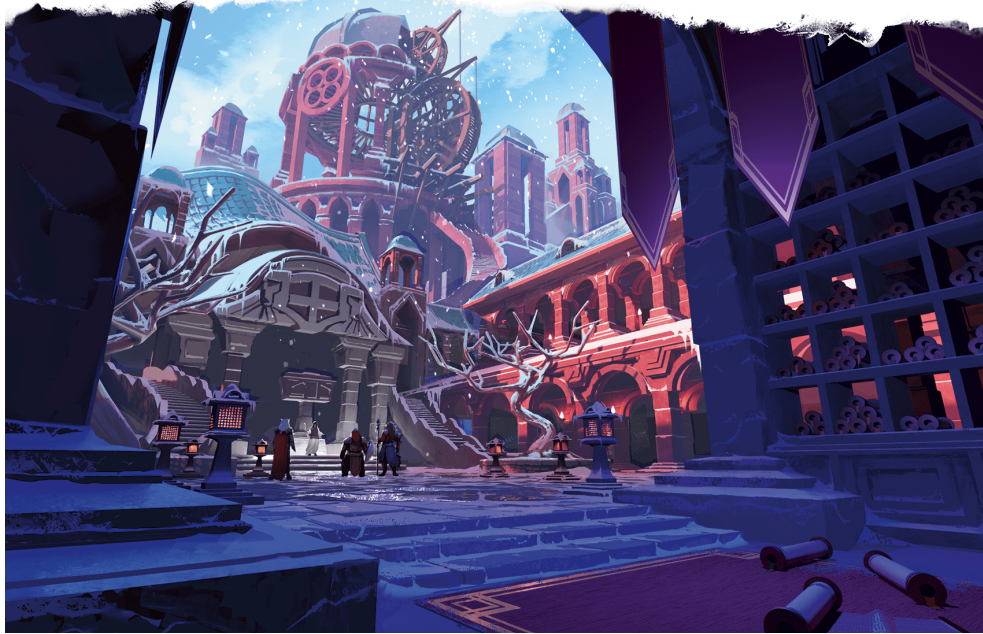
THE ADDITION OF AN OBSERVATORY CAN LEAD TO THE DISCOVERY OF ELDRITCH SECRETS LOST AMONG THE STARS