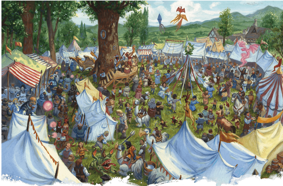
A HERO'S BASTION HOSTS A SPRING FESTIVAL TO WHICH EVERYONE IS INVITED

Your Bastion is given the opportunity to host an important festival or celebration, fund the research of a powerful spellcaster, or appease a domineering noble. Work with the DM to determine the details.