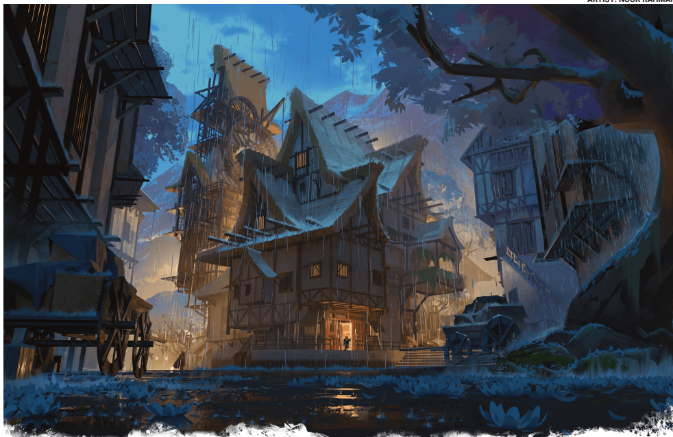
A ROGUE’S BASTION ON THE OUTSKIRTS OF TOWN CONTAINS A GUILDHALL, A PUB, AND MORE!

You can slow the frequency of Bastion turns to better serve the needs of your players and your campaign. For example, if the characters have months between adventures, you can call for a Bastion turn every month instead of every 7 days, so the characters aren’t issuing so many orders or reaping too many benefits at once.