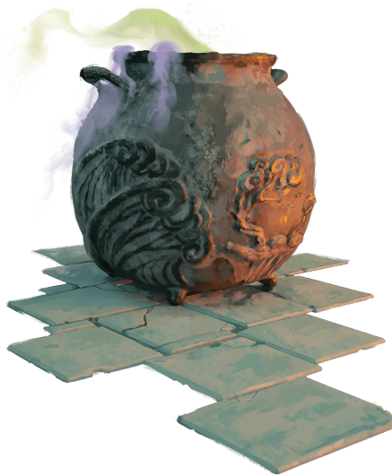
A CAULDRON IS STANDARD EQUIPMENT IN A POTION BREWER'S LABORATORY